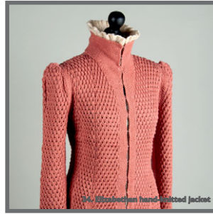
34. Norwegian hand-knitted jacket