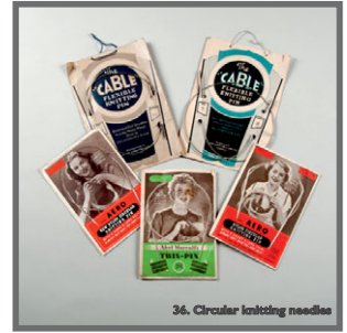
36. Circular knitting needles