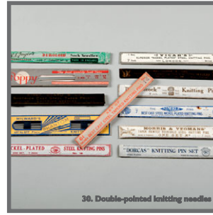
30. Double-pointed knitting needles