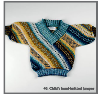
40. Child's hand-knitted jumper