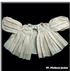
49. Machine jacket