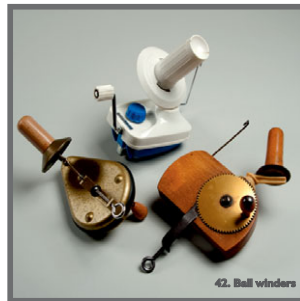
42. Ball winders