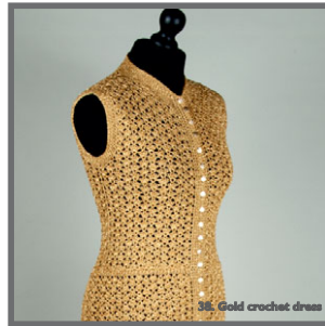
38. Gold crochet dress