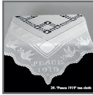
29. 'Peace 1919' tea cloth