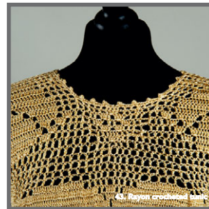
43. Yellow crocheted top