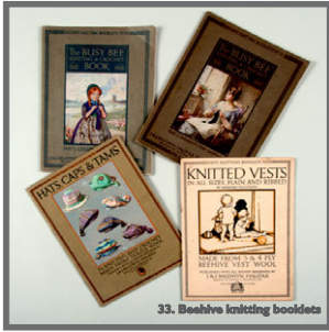
33. Beehive knitting booklets