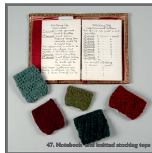
47. Notebook and knitted stocking tops