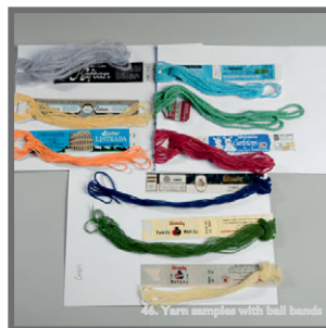
46. Yarn samples with ball bands