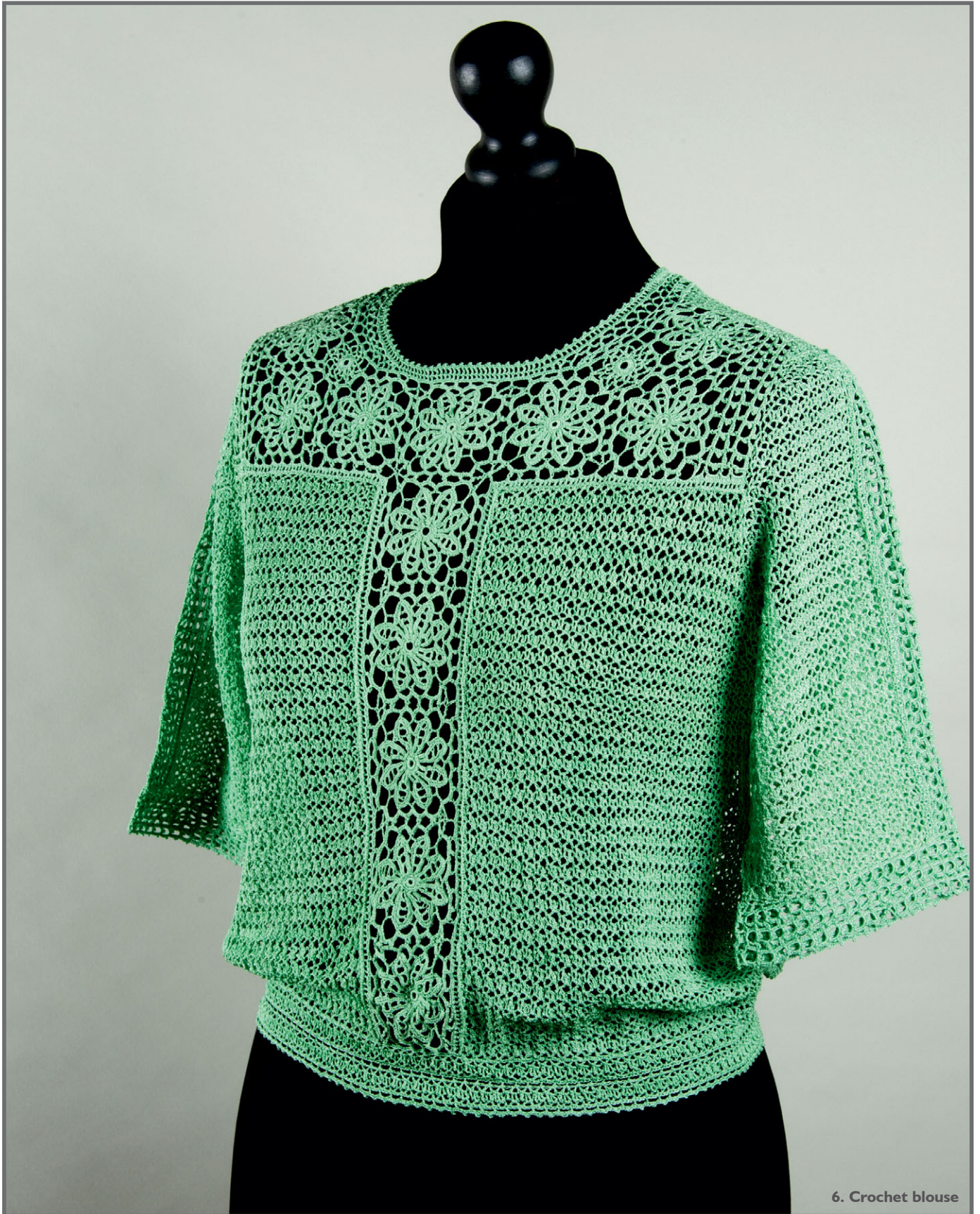
6. Crochet blouse

100 objects Part of the Collection of the Knitting & Crochet Guild