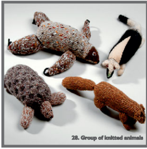
28. Group of knitted animals