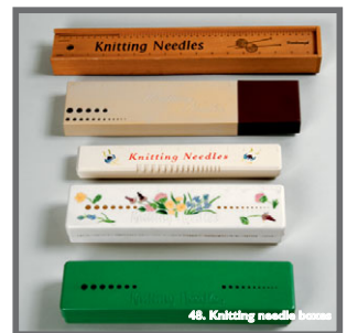
48. Knitting needles boxes