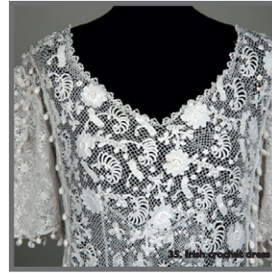
35. Irish lace dress