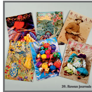
39. Rowan journals