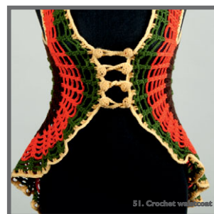
51. Crochet waistcoat