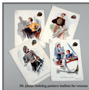
50. Jeanette knitting pattern leaflets for women