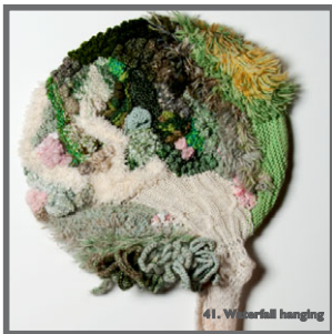
41. Woolfall hanging