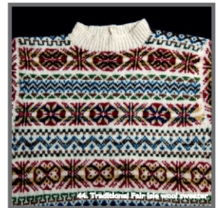
44. Traditional Fair Isle wool jumper