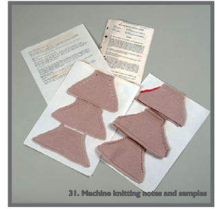
31. Machine knitting tools and samples